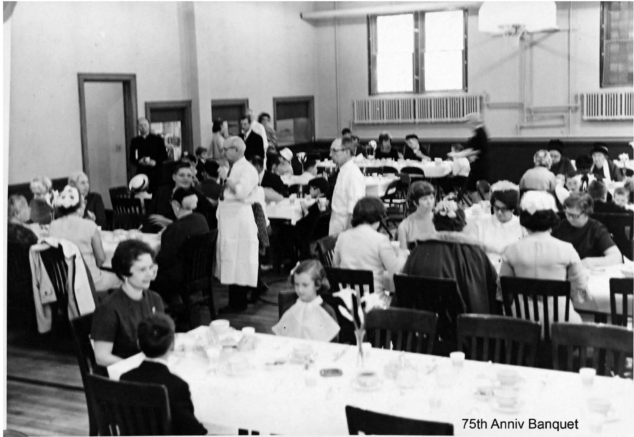
75th Anniv Banquet