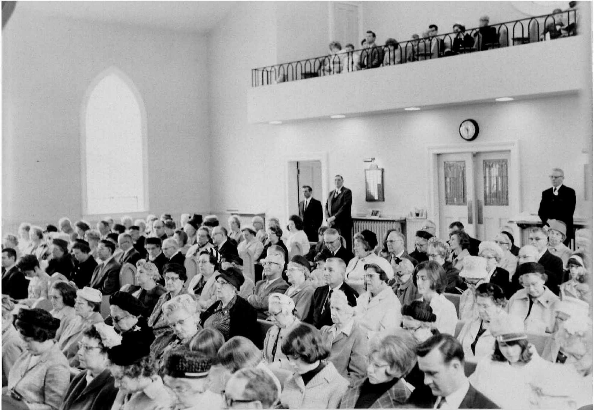
75th Anniv Banquet 1967