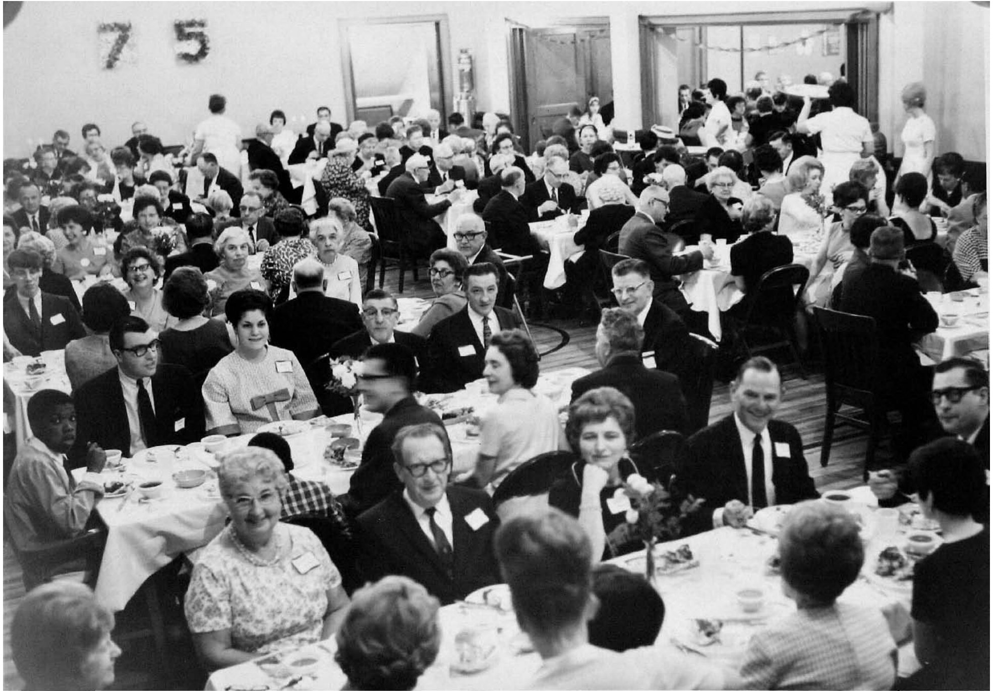
75th Anniv Banquet 1967