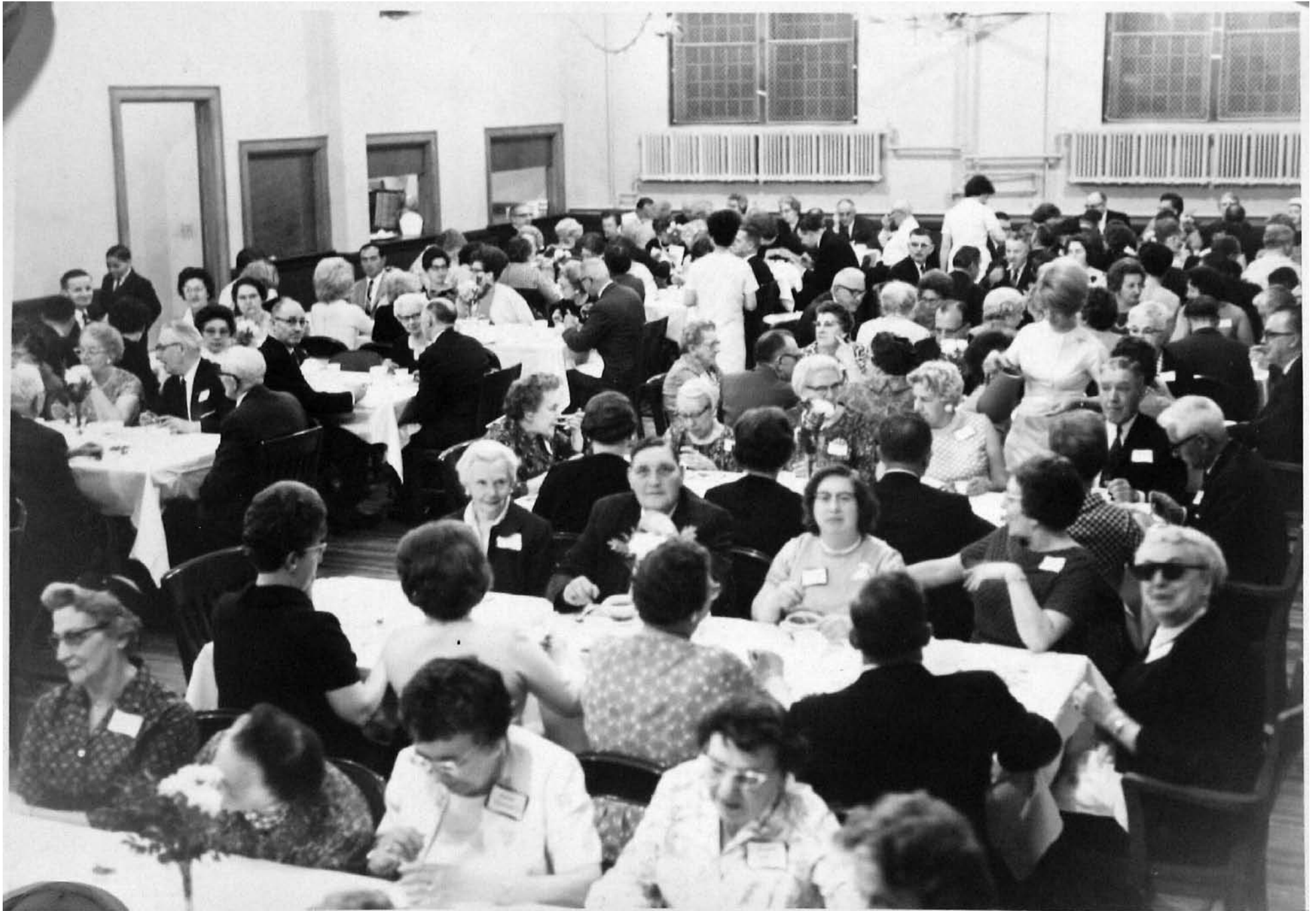
75th Anniv Banquet 1967